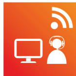
Communication & Management